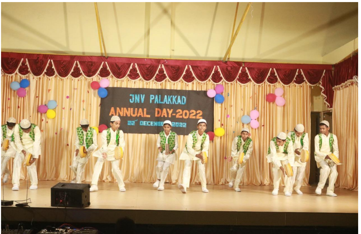
Dappu Kottu of Kerala