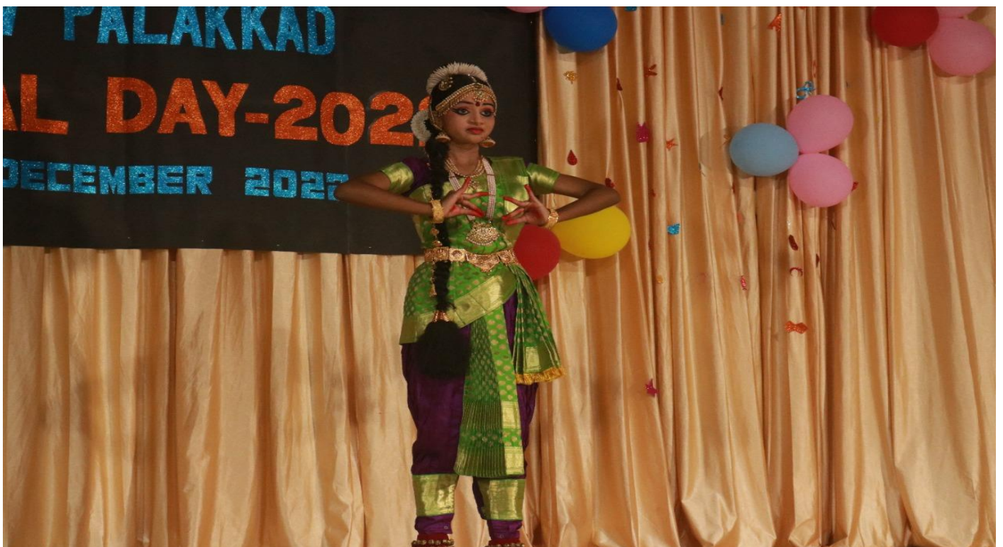
Kuchipudi Dance of Andhra Pradesh