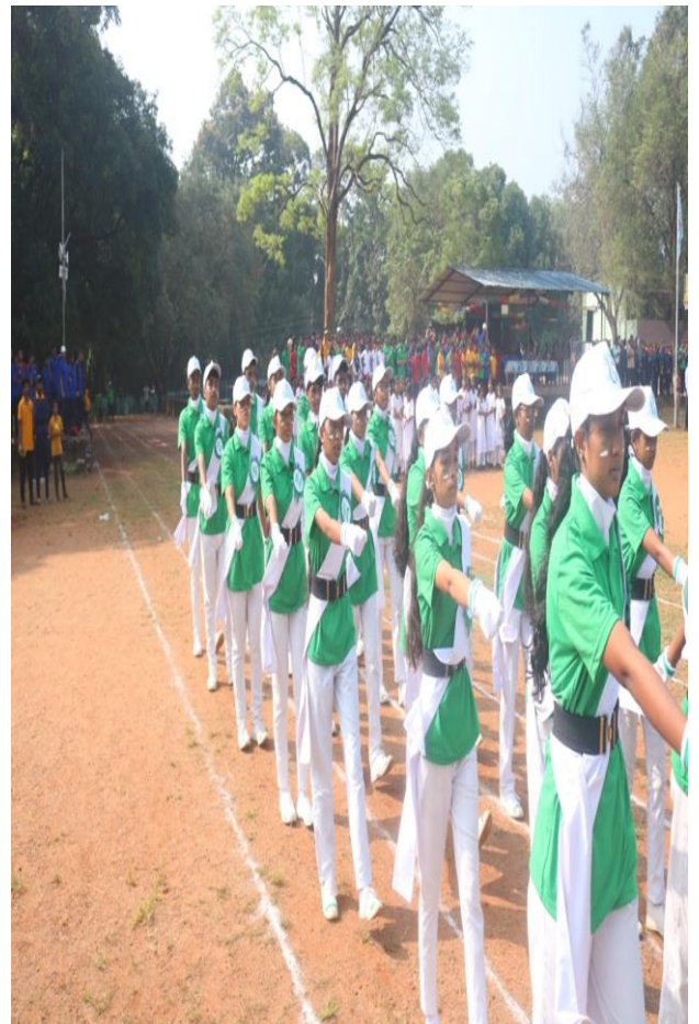
Inter House March Past Competition